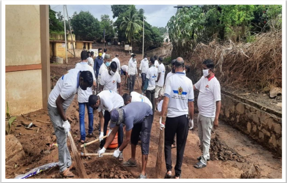
Cleaning of flood affected area in Ankalkhop